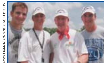
The Manning Family: Eli, Cooper, Archie & Peyton

The mission of the Academy is to create an environment of greater understanding and proficiency with the fundamentals, techniques, and skills that are necessary in succeeding in the sport of football. For more information on the Manning Passing Academy, you can log onto www.manningpassingacademy.com . ■