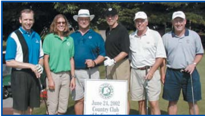
INDIANA SPORTS CORP.